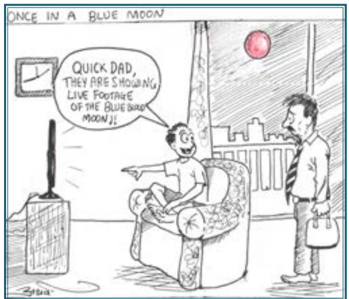
-Atharva Vankudre, IX C